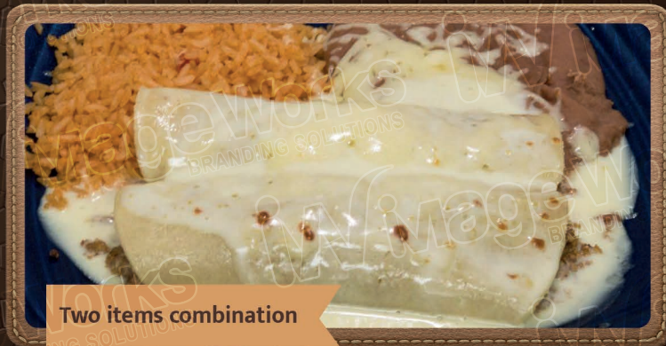
Two items combination

Rice, refried beans, charro beans, Steamed vegetables (broccoli, cauliflower, and carrot) Or papas con chorizo (Potatoes with Mexican sausage).