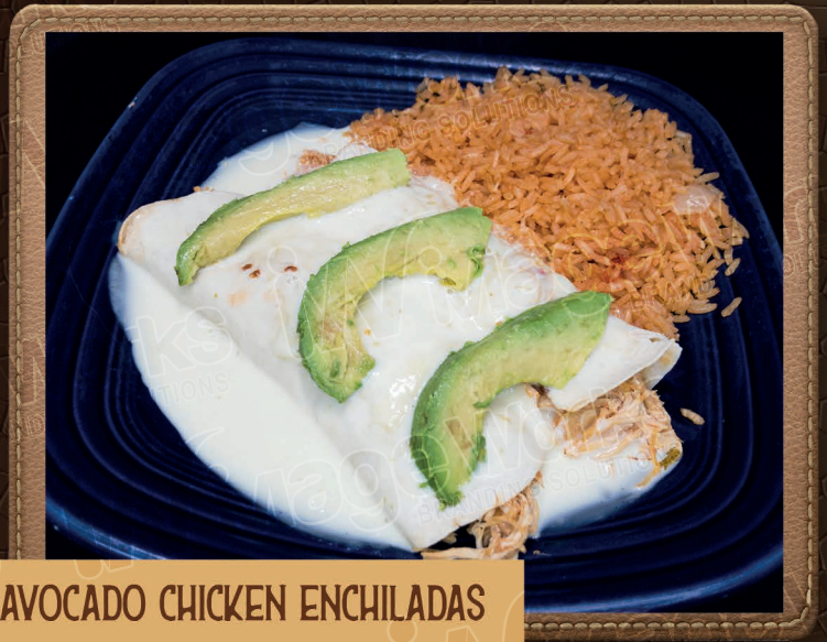
AVOCADO CHICKEN ENCHILADAS

One burrito with grilled chicken or steak, cheese sauce on top. Served with rice and beans. 10.04